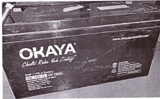
Figure-I (Front view)

Test Report No. : ETDC(MH)/T&M/098 Unique Lab Report No. : ULR- TC5465200000022F Issued on : 12-05-2020